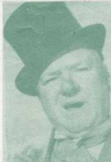
W. C. FIELDS