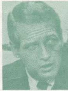
PAUL NEWMAN IN "HARPER"