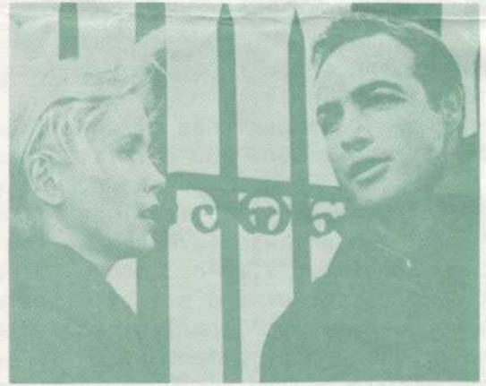
ON THE WATERFRONT