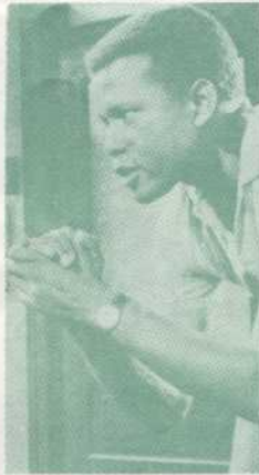
RAISIN IN THE SUN