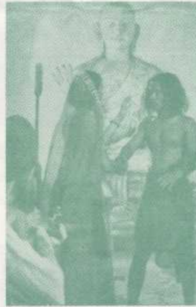
THE JUNGLE BOOK